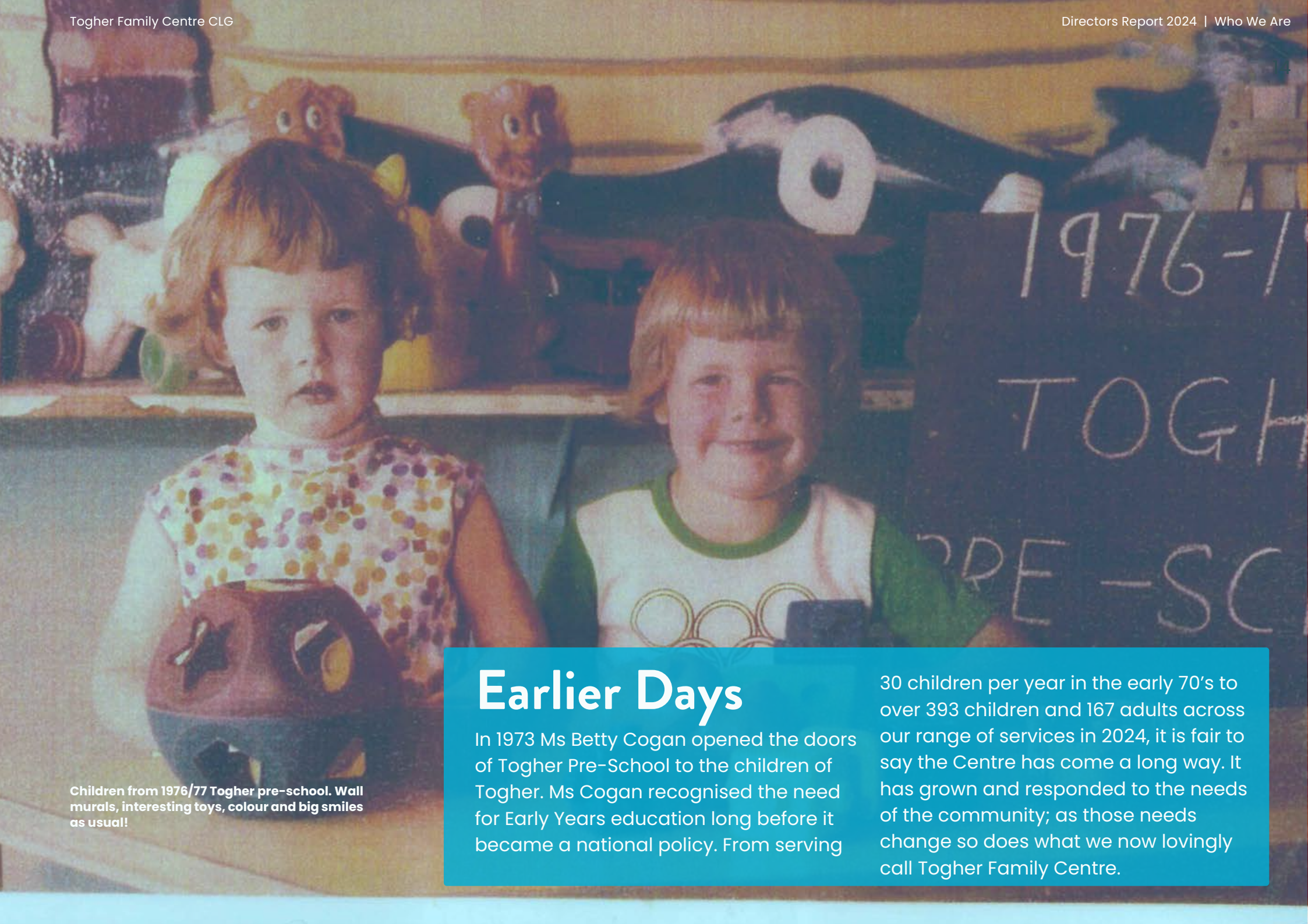
Children from 1976/77 Togher pre-school. Wall murals, interesting toys, colour and big smiles as usual!